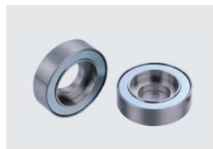
吸力件 Magnetic pots