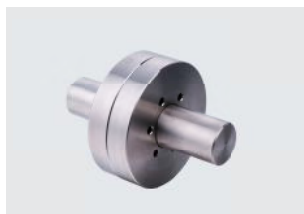
磁力传感器 Component of magnet load