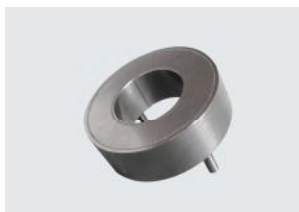
带螺栓密封吸力件 Encapsulation magnets