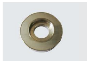
激光焊接密封磁路 Magnet sealed by laser welding