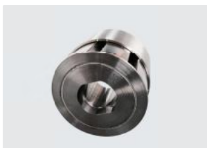
高压水枪磁制动器 Magnetic brake for water blasting gun